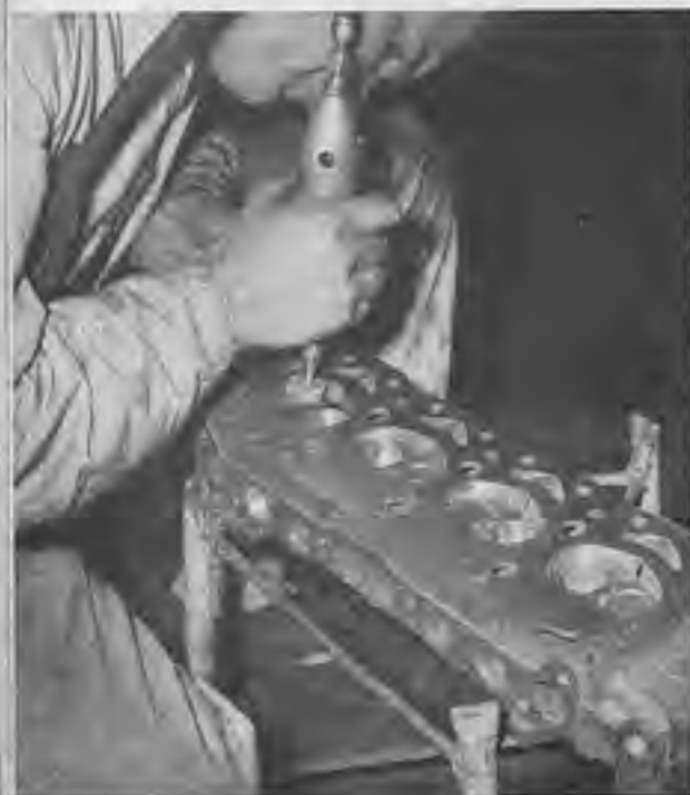
Combustion chamber shape should remain basically the same as original, only the rough edges being smoothed down. Specialist firms can produce the spectacular results with more complex head work.

Big double choke racing Weber carburetors dwarf Anglia engine. Costly, they are better for racing cars rather than road models.